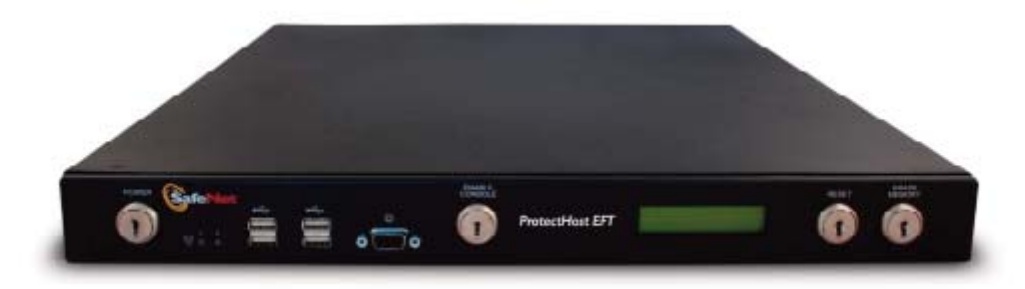
Figure 2.1.1. SafeNet Luna EFT

The loader firmware is implemented as a 32-bit protected mode Intel executable and runs as the only application on a specially cut-down Fedora Core 3 (FC3) Operating System (O/S). The FC3 system launches the loader firmware and provides disk and memory management services and communication services to the loader firmware.